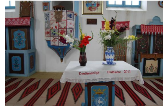
Unitarian Church in Gyepes, Transylvania