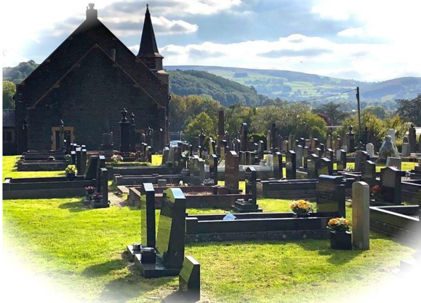
The beautiful hills of Wales around Brondeifi Chapel

Unitarian Universalist Partner Church Council 483 E. Lockwood Ave Suite 109 St. Louis, MO 63119 Phone: 314-918-2618 E-mail: office@uupcc.org