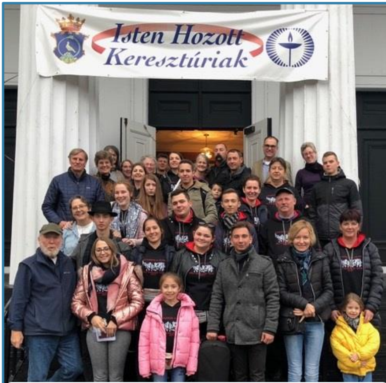
Transylvanian travelers with some members and staff on the front steps of First Parish in Concord.