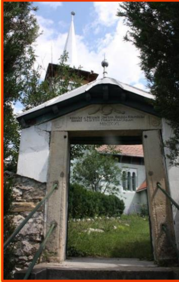
Mézskő Unitarian Church