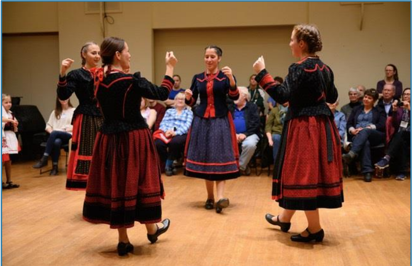
The Hungarian troupe women dancing in beautiful costumes.

Note: This trip was supported with a UUPCC Cathy Cordes Travel Grant.