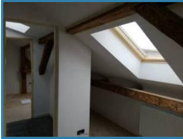
Déva Unitarian Guesthouse room under construction.

Almost all our UUPCC pilgrimages to Transylvania stop in Déva, the sacred place where the Unitarian founder Dávid Ferenc (Francis David) died in prison.